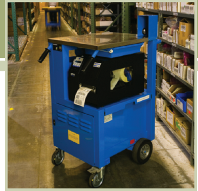
Shown with T5000r™ printer (not included)